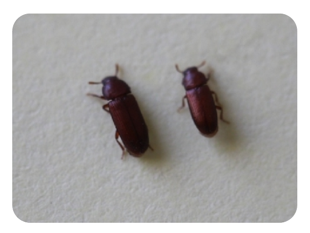
Fig. 9. Adult of T. castaneum.

Duration of different larval instars in the Table 2, manifested that the first, second, third, fourth, fifth, sixth instars exhibited significant differences between the varieties. The larval period range of the first instar varied significantly between 5.07 to 6.02 with the lowest and highest 5.07 and 6.02 days on Swetha, and GT-10 respectively. The larval period of the second instar significantly lowest on Swetha (4.48 days) and the highest on 6<sup>th</sup> instar GT-10 (7.48 days). There is a