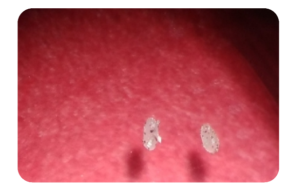
Fig. 1. Eggs of T. castaneum.

Red flour beetle Tribolium castaneum life cycle involved egg, larva, pupa and adult stages (Figs. 1-9). The larval stage passed through six instars. Observations on incubation period, larval duration; pupal duration, adult longevity; length and breadth of different immature stages and adult were recorded.