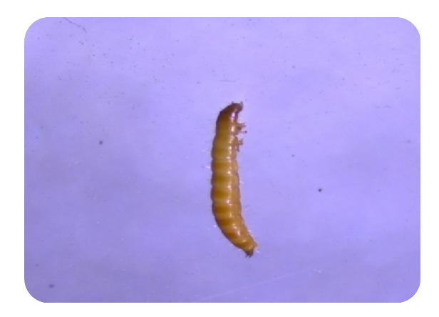
Fig. 7. Sixth instar grub of T. castaneum .