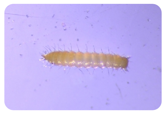
Fig. 2. First instar grub of T. castaneum.