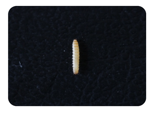
Fig. 5. Fourth instar grub of T. castaneum .