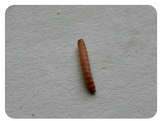
Fig. 4. Third instar grub of T. castaneum .