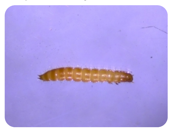
Fig. 6. Fifth instar grub of T. castaneum .