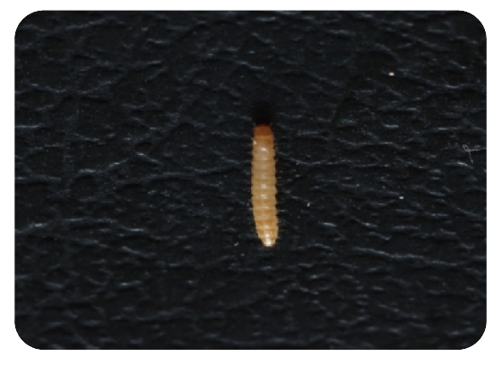
Fig. 3. Second instar grub of T. castaneum .